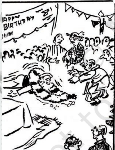
I told him to make the garland smaller... He is a frail old man and wouldn't be able to stand the weight of such a huge garland!