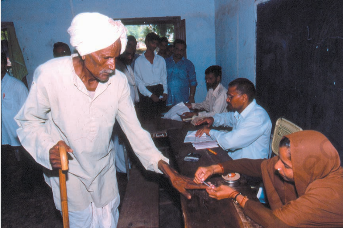
Voting in a rural area: A mark is put on the finger to make sure that a person casts only one vote.

decisions for the entire population. These days a government cannot call itself democratic unless it allows what is known as universal adult franchise. This means that all adults in the country are allowed to vote.