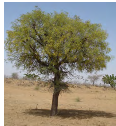
Figure 16.3 Khejri Tree

We need to accept that human intervention has been very much a part of the forest landscape. What has to be managed in the nature and what may be the extent of this intervention? Forest resources ought to be used in a manner that is both environmentally and developmentally sound – in other words, while the environment is preserved, the benefits of the controlled exploitation go to the local people, a process in which decentralised economic growth and ecological conservation go hand in hand. The kind of economic and social development we want will ultimately determine whether the environment will be conserved or further destroyed. The environment must not be regarded as a pristine collection of plants and animals. It is a vast and complex entity that offers a range of natural resources for our use. We need to use these resources with due caution for our economic and social growth, and to meet our material aspirations.