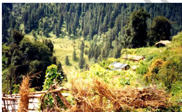
Figure 16.2 A view of a forest life

Do you think such use of forest resources would lead to the exhaustion of these resources? Do not forget that before the British came and took over most of our forest areas, people had been living in these forests for centuries. They had developed practices to ensure that the resources were used in a sustainable manner. After the British took control of the forests (which they exploited ruthlessly for their own purposes), these people were forced to depend on much smaller areas and forest resources started becoming over-exploited to some extent. The Forest Department in independent India took over from the British but local knowledge and local needs continued to be ignored in the management practices. Thus vast tracts of forests have been converted to monocultures of pine, teak or eucalyptus. In order to plant these trees, huge areas are first cleared of all vegetation. This destroys a large amount of biodiversity in the area. Not only this, the varied needs of the local people – leaves for fodder, herbs for medicines, fruits and nuts for food – can no longer be met from such forests. Such plantations are useful for the industries to access specific products and are an important source of revenue for the Forest Department.