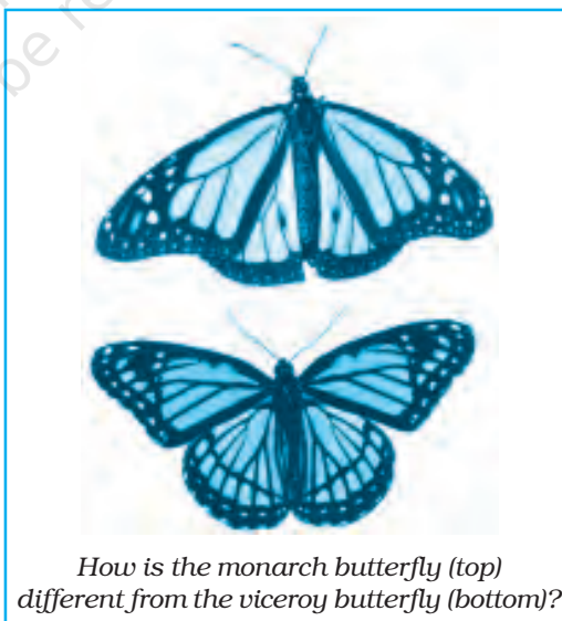
How is the monarch butterfly (top) different from the viceroy butterfly (bottom)?