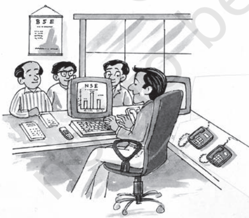
Electronic Trading System