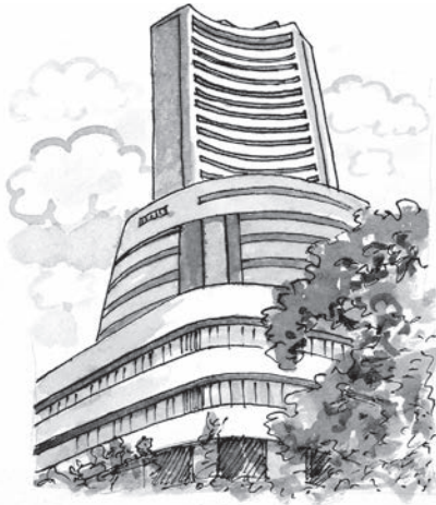
Bombay Stock Exchange