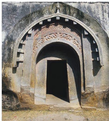
Lomesh Rishi cave-entrance detail