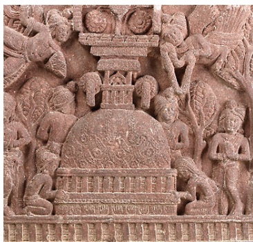
Stupa worship, Bharhut

The method of working was collective in nature and at times only a specific portion of the monument is said to have been patronised by a particular patron. Traders recorded their donation along with their place of origin.