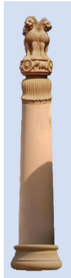
Pillar capital and abacus with stylised lotus

Construction of stupas and viharas as part of monastic establishments became part of the Buddhist tradition. However, in this period, apart from stupas and viharas , stone pillars, rock-cut caves and monumental figure sculptures were carved at several places. The tradition of constructing pillars is very old and it may be observed that erection of pillars was prevalent in the Achaemenian empire as well. But the Mauryan pillars are different from the Achaemenian pillars. The Mauryan pillars are rock-cut pillars thus displaying the carver's skills, whereas the Achaemenian pillars are constructed in pieces by a mason. Stone pillars were erected by Ashoka, which have been found in the north Indian part of the Mauryan Empire with inscriptions engraved on them. The top portion of the pillar was carved with capital figures like the bull, the lion, the elephant, etc. All the capital figures are vigorous