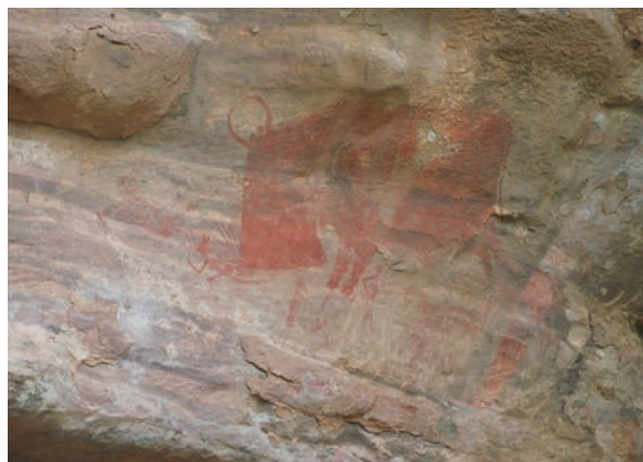
Painting showing a man being hunted by a beast, Bhimbetka

made out of limestone. The rock of mineral was first ground into a powder. This may then have been mixed with water and also with some thick or sticky substance such as animal fat or gum or resin from trees. Brushes were made of plant fibre. What is amazing is that these colours have survived thousands of years of adverse weather conditions. It is believed that the colours have remained intact because of the chemical reaction of the oxide present on the surface of the rocks.