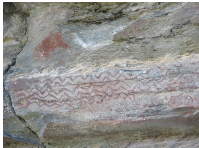
Wavy lines, Lakhudiyar, Uttarakhand