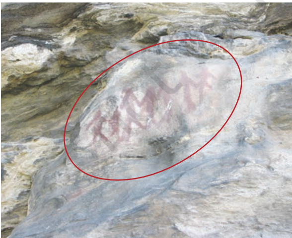
Hand-linked dancing figures, Lakhudiyar, Uttarakhand

Remnants of rock paintings have been found on the walls of the caves situated in several districts of Madhya Pradesh, Uttar Pradesh, Andhra Pradesh, Karnataka and Bihar. Some paintings have been reported from the Kumaon hills in Uttarakhand also. The rock shelters on banks of the River Suyal at Lakhudiyar, about twenty kilometres on the Almora–Barechana road, bear these prehistoric paintings. Lakhudiyar literally means one lakh caves. The paintings here can be divided into three categories: man, animal and geometric patterns in white, black and red ochre. Humans are represented in stick-like forms. A long-snouted animal, a fox and a multiple legged lizard are the main animal motifs. Wavy lines, rectangle-filled geometric designs, and groups of dots can also be seen here. One of the interesting scenes depicted here is of hand-linked dancing human figures. There is some superimposition of paintings. The earliest are in black; over these are red ochre paintings and the last group comprises white paintings. From Kashmir two slabs with engravings have been reported. The granite rocks of Karnataka and Andhra Pradesh provided suitable canvases to the Neolithic man for his paintings. There are several such sites but more famous among them are Kupgallu, Piklihal and Tekkalkota. Three types of paintings have been reported from here—paintings in white, paintings in red ochre over a white background and paintings in red ochre. These