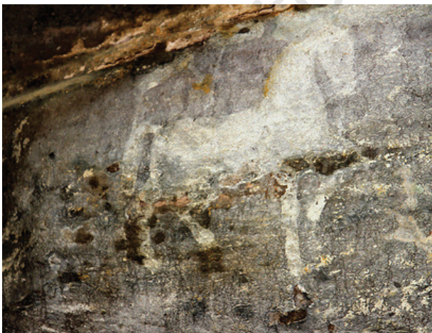
One of the few images showing only one animal, Bhimbetka

The artists of Bhimbetka used many colours, including various shades of white, yellow, orange, red ochre, purple, brown, green and black. But white and red were their favourite colours. The paints were made by grinding various rocks and minerals. They got red from haematite (known as geru in India). The green came from a green variety of a stone called chalcedony. White might have been