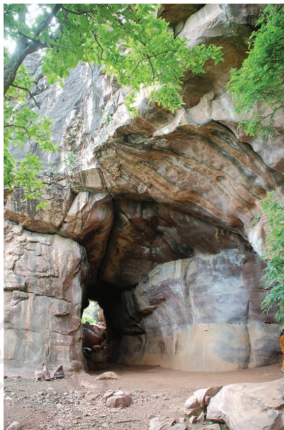
Cave entrance, Bhimbetka, Madhya Pradesh

The paintings of the Upper Palaeolithic phase are linear representations, in green and dark red, of huge animal figures, such as bisons, elephants, tigers, rhinos and boars besides stick-like human figures. A few are wash paintings but mostly they are filled with